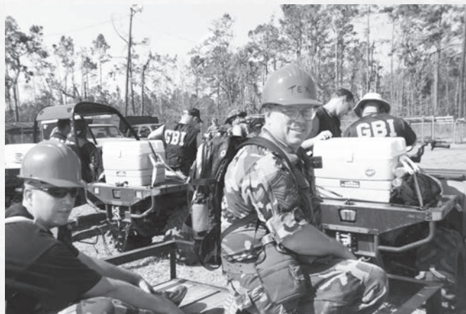
Members of the 110th Fighter Wing activate to support hurricane recovery operations in Louisiana and Mississippi.

Even as the Wing's future seemed in turmoil, members of the 110th rose to the occasion during another Air Combat Command Operational Readiness Inspection, held at Alpena CRTIC. The