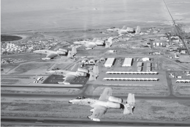
A-10's in formation over Southwest Asia.

to a communications tent, being chased by three or four wild dogs that were nipping at my heels. I got refueled and left Tallil very quickly to continue our search, which was soon called off, and no survivor was found. After a very quick exposure to Tallil on April 4th, I wondered if I had made the right choice!