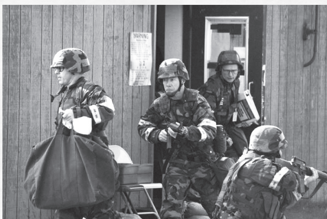
110th Fighter Wing members "bug out" of their shelter during the Operational Readiness Inspection, Alpena, Mich.

In August 2005, with much of the Gulf Coast devastated by Hurricane Katrina, Michigan answered the call to accept up to 10,000 evacuees from Mississippi, Alabama and Louisiana. The 110th was an integral part of the reception of these displaced individuals. By Saturday of Labor Day weekend, 300 evacuees had been prescreened or received care at Battle Creek Air National Guard Base before relocation to nearby Fort Custer. Fifty-four members from the 110th Civil Engineer Squadron, Military Personnel Flight, Transportation, and Chapel offices were also activated to support hurricane recovery operations in Louisiana and Mississippi.