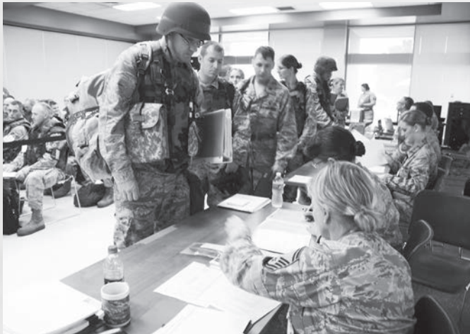
Servicemembers from the 110th Airlift Wing, prepare for their second Operational Readiness Exercise (ORE) in preparation for an Operational Ready Inspection (ORI). The guardsmen traveled to the Combat Readiness and Training Center at Volk Field, Wis.