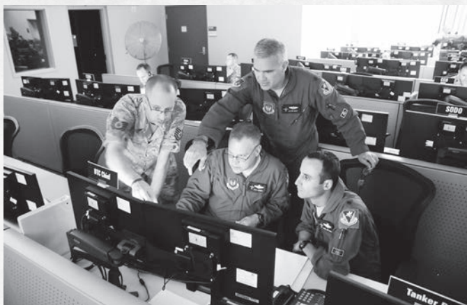
Members of the 217th Air Operations Group conduct command and control exercises during Northern Strike 2014 at the Battle Creek Air National Guard Base. The three-week event included twenty-four units from 12 states and two Coalition partners and took place primarily at Alpena Combat Readiness Training Center and Camp Grayling Joint Maneuver Training Center.