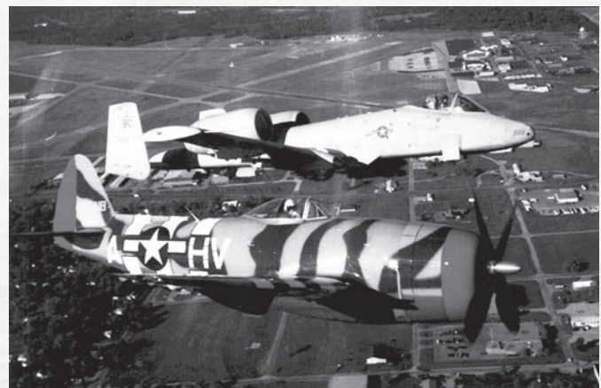
An A-10 Thunderbolt II and a P-47 Thunderbolt take flight together during the Battle Creek Air National Guard's 50th Anniversary Celebration.

On Saturday of UTA, several military aircraft flew in for a static display, including a P-47 Thunderbolt and an O-2A Skymaster, one of the aircraft previously assigned to the 110th. Hundreds of visitors, many of them former members and retirees of the 110th, were on hand to mark the occasion.