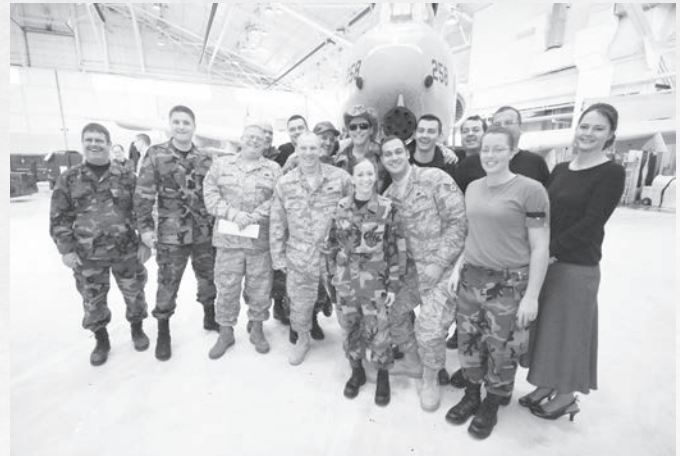
Rocker Ted Nugent visits the Battle Creek Air National Guard Base.

hearing of the relocation. The deployed members of the 110th supported Operation Enduring Freedom diligently, returning to Battle Creek on January 22, 2008.