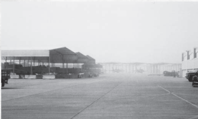
The Al Jaber AB, Kuwait flightline during a dust storm.

only to discover that a fellow pilot was frantically scurrying to find his mask. When it dawned on us that I had taken his mask, we did a quick exchange which later made for an embarrassing laugh when we knew all the panic was for nothing. There were both fun times and not so fun times. Some of my less pleasant memories included the anthrax and small pox shots, and the spider bite that put me on crutches for two days.