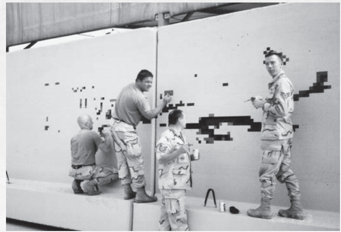
110th Fighter Wing members design barrier art in their down time, Al Jaber AB, Kuwait. Decorated barriers could be seen in and around the installation.

only to discover that a fellow pilot was frantically scurrying to find his mask. When it dawned on us that I had taken his mask, we did a quick exchange which later made for an embarrassing laugh when we knew all the panic was for nothing. There were both fun times and not so fun times. Some of my less pleasant memories included the anthrax and small pox shots, and the spider bite that put me on crutches for two days.