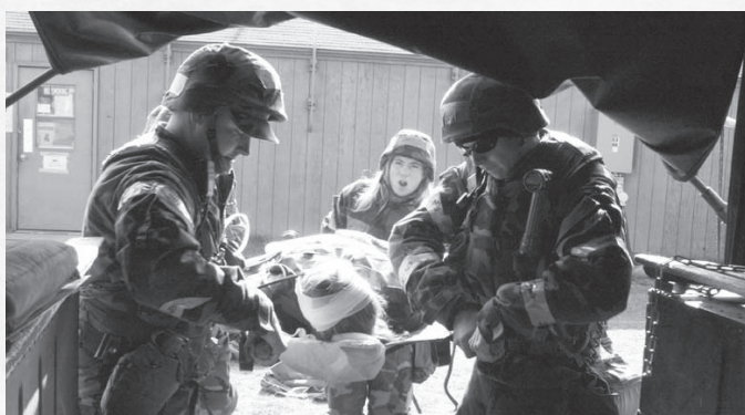
110th Fighter Wing members load a "wounded" airman into the back of a truck during the Operational Readiness Inspection, Alpena, Mich.

Even as the Wing's future seemed in turmoil, members of the 110th rose to the occasion during another Air Combat Command Operational Readiness Inspection, held at Alpena CRTIC. The