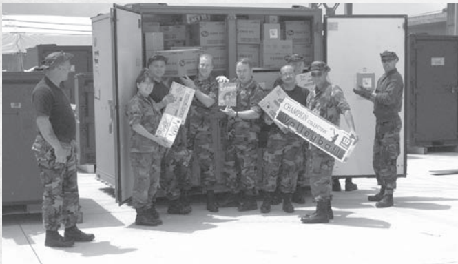
110th Fighter Wing members unpack a conex bin of MWR and food supplies during Operation Noble Anvil, Trapani Air Base, Italy.

sent in with targets to hunt for, we are being held outside the Kosovo airspace in reserve in case the NATO ground forces come under fire and need air support. It appears that this schedule will hold for a few more days while the NATO commanders figure out what they'd like to do with us. The rumor mill is in full swing with all kinds of stories being spread about. The simple truth is that, at this point, the commanders have not decided our fate yet. When they do, the message will be relayed and plans will be made accordingly.