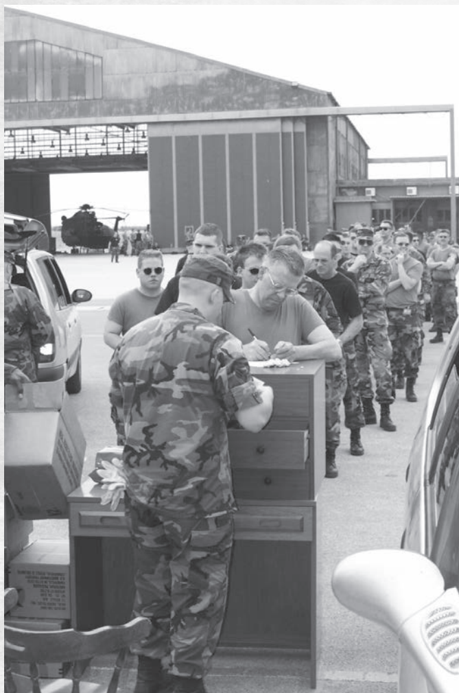
110th Fighter Wing members are issued MRE's during Operation Noble Anvil, Trapani Air Base, Italy.

The NATO mission in the Balkans sought to convince Serbian political and military leadership that the costs of war were so high that they should pursue peace. Its objectives were to deter Belgrade from increasing its offensive against Kosovar Albanians, damage Belgrade's capacity to take repressive action and demonstrate the alliance's resolve of purpose in forcing Serbian political and military leadership to change course.