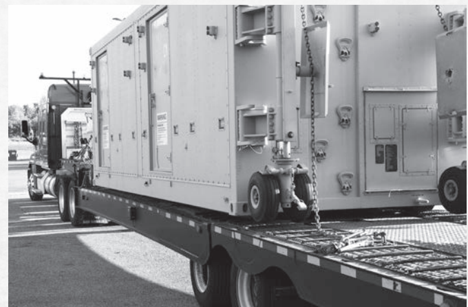
The 110th Attack Wing Operations Group receives its first MQ-9 Ground Control Station Friday, August 29, 2016 at the Battle Creek Air National Guard Base, Mich.

The 110th Operations Group officially stood up its MQ-9 Reaper organization on October 1, 2013. However, with the specialized operations facility still in development, this meant that members of the 110th Operations Group would travel to other bases with active MQ-9 missions to train and participate in the mission. The operations tempo for these crew members remained steady throughout 2014 as they sought to navigate the learning curve that came with a new mission in which the aircraft they supported were physically located thousands of miles from their control stations.