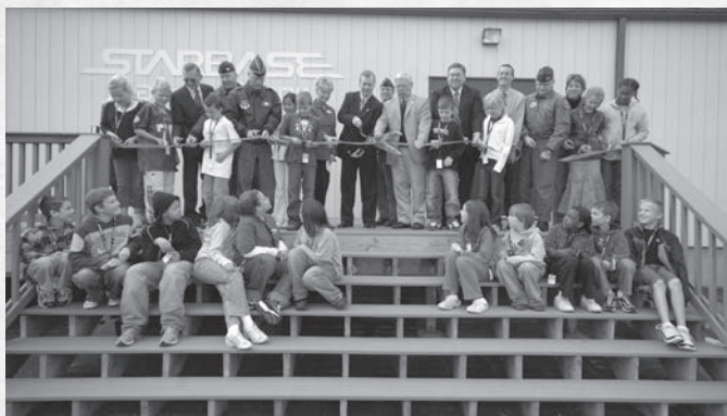
110th Fighter Wing opens STARBASE, a program for local elementary students to enrich skills in math and science.