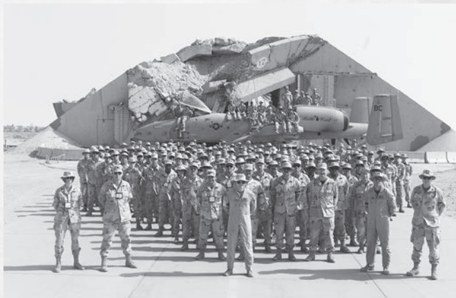
110th Fighter Wing members pose for a photo in front of a bombed out hardened aircraft shelter during Operation Southern Watch, Al Jaber AB, Kuwait.

Even after the success of the 110th Fighter Wing in Kosovo, the deployment tempo in support of the Air Expeditionary Force did not slow down. From May 1 to September 8, 314 personnel from Battle Creek Air National Guard Base deployed as a part of AEF 7 to locations as remote as Al Jaber and Ali Al Salem, Kuwait and Incirlik, Turkey in support of Operation Southern Watch. These included airmen in the specialties of Civil Engineering, Logistics support, Communications and Medical. Combined, this marked the largest deployment event to date for the 110th Fighter Wing. 170 sorties were flown from Al Jaber Air Base alone during the one-month trip.