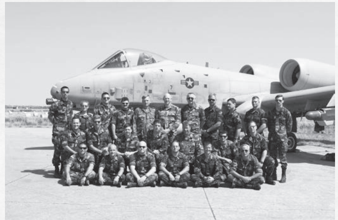
A total of 156 airmen from the 110th Fighter Wing deployed in support of Operation Noble Anvil to Trapani Air Base, Italy.

The suspension of the Kosovo bombing campaign on June 10 and the end of the air war on June 20 put the 131st into a contingency operation mission where the aircraft flew just outside the Kosovar region, ready to give aid if called upon. By the end of June, it was clear that the 131st would stand down and its members would return home.