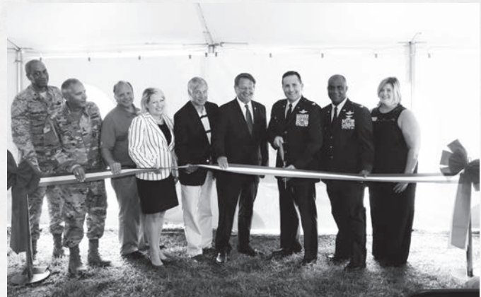
The 110th Attack Wing holds a ribbon cutting ceremony and open house in celebration of their new MQ-9, Remotely Piloted Aircraft (RPA) mission. The event was attended by a host of elected officials, distinguished visitors and local media.

The departure of the C-21 marked the beginning of a new era and a new vision for the Wing. Now focusing on cutting-edge technology used across the entire Air Force, the 110th would be responsible for conducting surveillance, reconnaissance, and irregular warfare operations in support of combat objectives without risking the lives of military pilots.