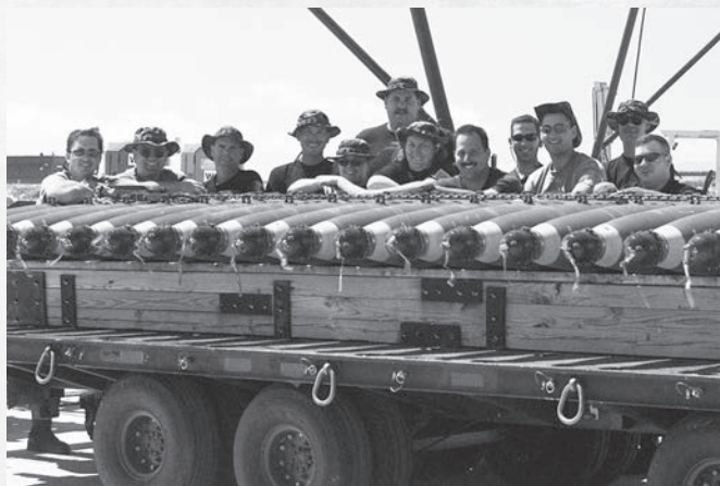
Members of the 110th Fighter Wing pose for a photo during Operation Noble Anvil, Trapani Air Base, Italy.

“Morale has been very good. Keeping busy at work is the key to that. The ammo builders and the weapons loaders are very happy to see the airplanes coming back with most ordnance missing from beneath the wings. After work there isn’t much time to see the sights or to get to know the local people and the culture of southern Italy. It is hard to believe that you could get tired of spaghetti, pasta and pizza, but I think that is happening quite a bit. This location is nothing similar to Aviano Air Base in climate, topography, food, or culture. Up to this point, we have been trying to get everyone one day off a week. With the work schedule that we’ve had, many people are choosing to just relax at the hotels rather than get very adventuresome with sight-seeing trips, etc. With the reduced flying right now as a result of the recent peacekeeping efforts, I hope that we all will take the opportunity to get a much broader education of what Sicily is all about.