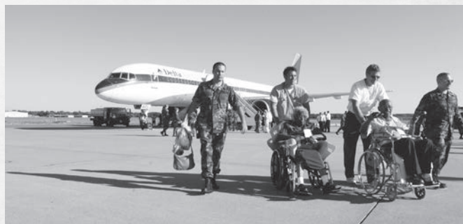
Members of the 110th Fighter Wing and medical personnel help bring New Orleans evacuees from their aircraft to a medical screening station at Battle Creek Air National Guard Base.