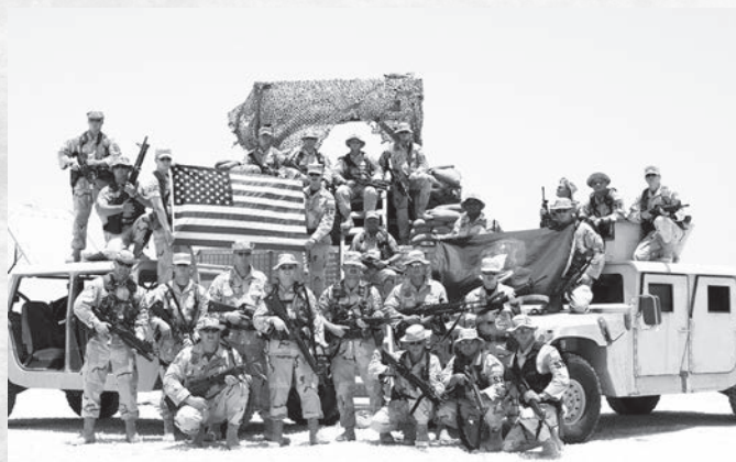
The 110th Security Forces Squadron, Operation Iraqi Freedom.

Most members deployed to Al Jaber Air Base returned to home station in January 2003, despite the looming war with Iraq. For many, it would prove to be a brief reunion with family and friends. In March, 370 personnel primarily from the 110th Operations and Maintenance Groups, along with 12 A-10s, were activated to fill a new tasking at Al Jaber. The bulk of this contingent left to an uncertain future on March 6.