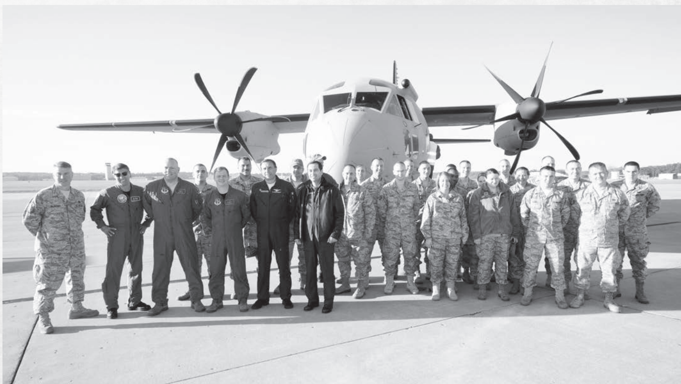
Members of the 110th Airlift Wing after the first C27J Spartan flight out of Battle Creek Air National Guard Base Battle Creek, Mich., Oct. 17, 2010. Members flew in the aircraft as part of a demonstration of the C27J Spartan.

As the Wing's forward outlook was crystalizing around the C-21 airlift and AOG missions, Battle Creek entered a year of inspection preparation and individual/small-unit deployments, sending out almost 200 members to training and contingency deployments world-wide. It was also a time of preparation for the Wing's projected C-27 Spartan mission, which showed much promise as a brand-new, highly versatile and combat-relevant airframe. The wing remained in this mode throughout most of 2010 and 2011, dividing its concentrations between