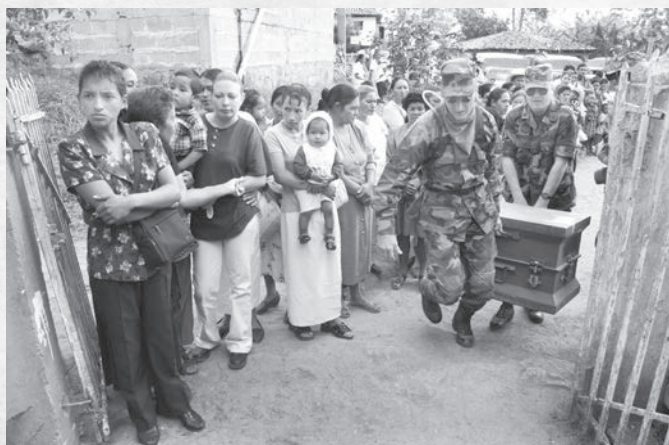
Members of the 110th Medical Squadron carry medical supplies Thursday, March 14, 2002, into a remote village in Honduras.