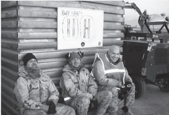
110th Fighter Wing Maintainers take a break while deployed during Operation Enduring Freedom, Bagram AB, Afghanistan.