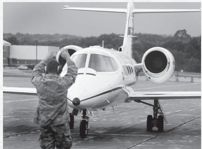
The 110th Airlift Wing receives first C-21 Learjet.